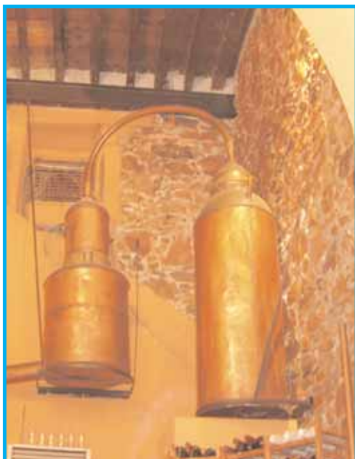
Old Greek Still